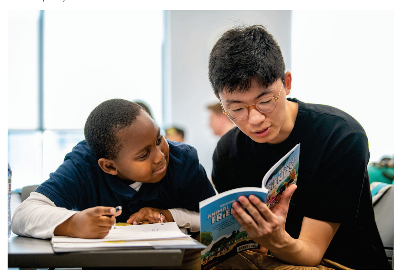
A University of Notre Dame student, right, tutors a child at the Robinson Community Learning Center.

When the pandemic closed everything down in spring of 2020, there was a group of RCLC middle and high school students that were preparing to go to New York City for the annual MyAmerica Trip. Three years later, the MyAmerica program was back, and those young people were specifically invited to participate. The semester-long program culminated with the long-delayed trip toNYC, attended by 14 youth participants. The young people reported that their visits to Ellis Island and the 9/11 Museum were particularly impactful. (They also enjoyed Times Square).