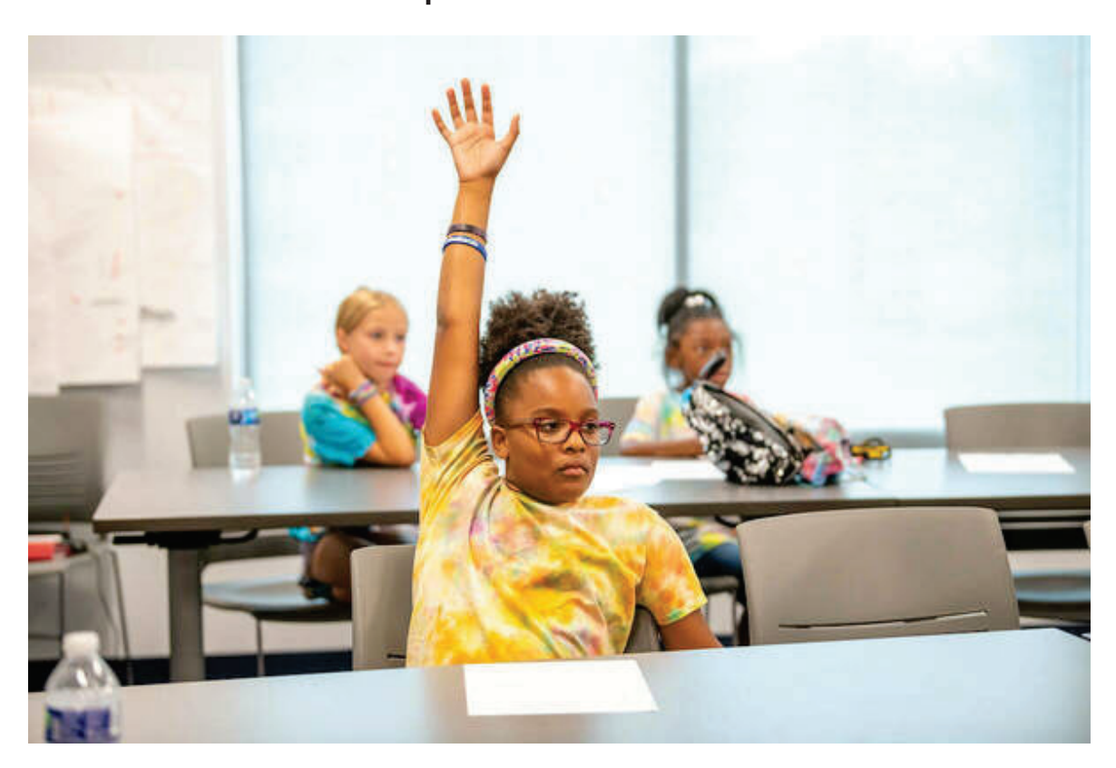
RCLC began an exciting new partnership with the Alliance for Catholic Education (ACE) Teaching Fellows program during summer 2023. The partnership allowed the Summer Camp to expand from a ½ day to a full day program. Read more about it here.